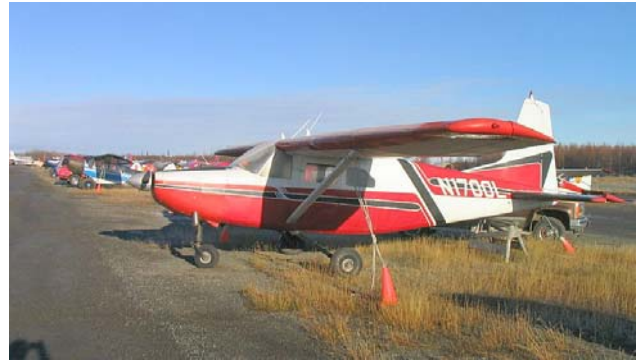
A Lockheed LASA 60, N1700L.

The total discounted rate for chapters, including all needed materials, college credit and shipping, is $344 for course 1 and $414 for course 2. To receive this discount or if you have any further questions, please contact Michelle Robbins at 920-426-6570 or mrobbins@eaa.org